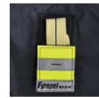
8. DRD Device