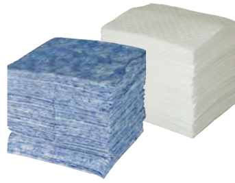
SPC105 features blue coverstock on one side.